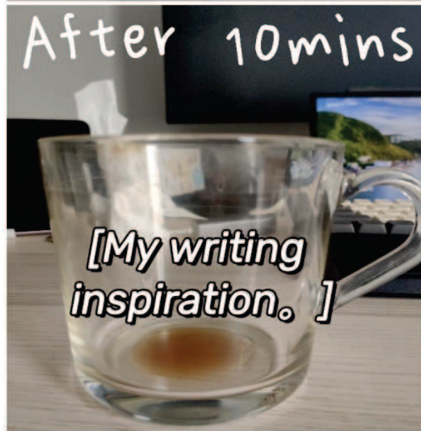
Writing inspiration by Hailiang Hu