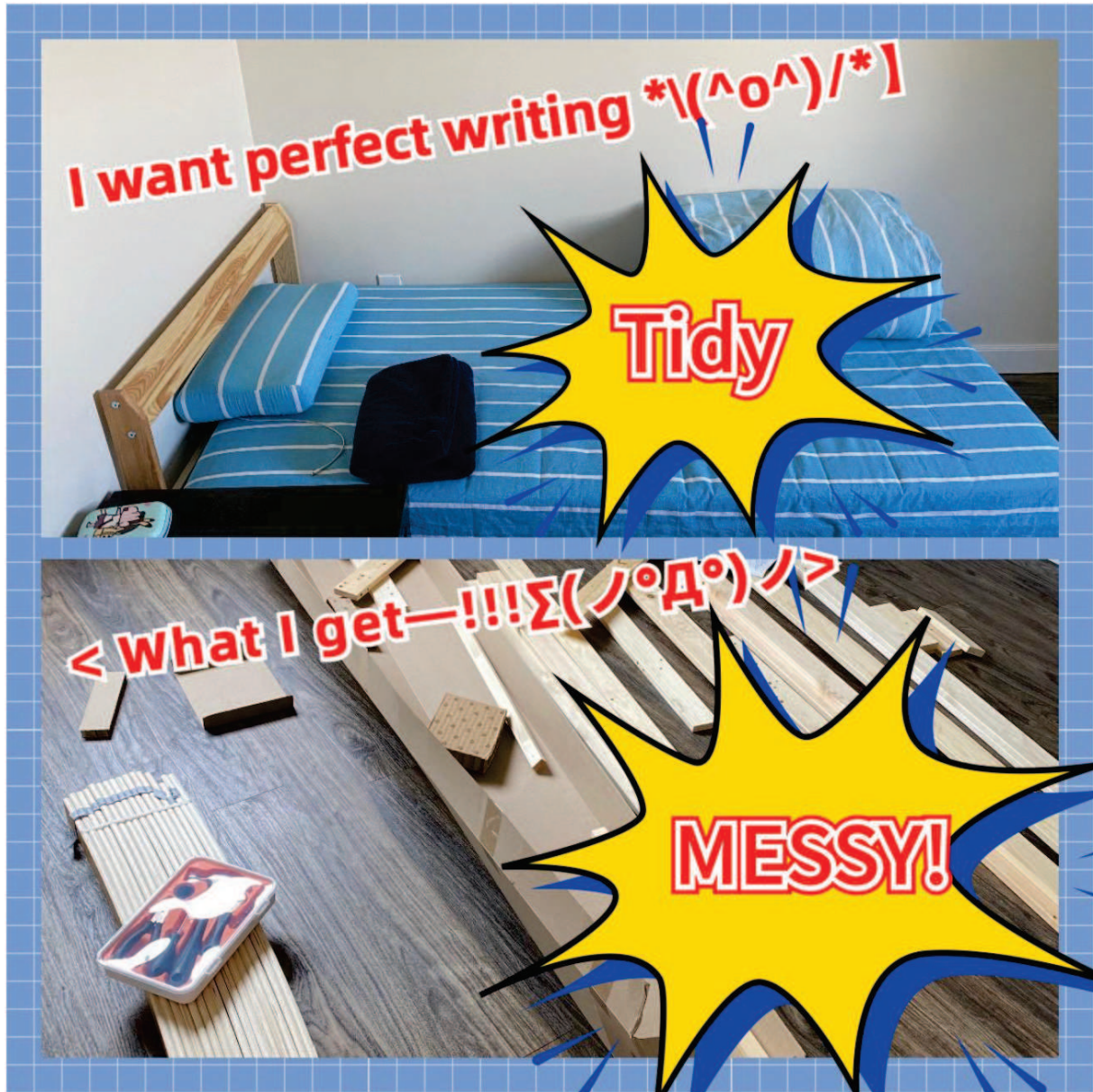
Perfect writing by Yikun (Eric) Wei

© ⓘ $ = This work is licensed under CC BY-NC-ND 4.0. To view a copy of this license, visit https://creativecommons.org/licenses/by-nc-nd/4.0/ .